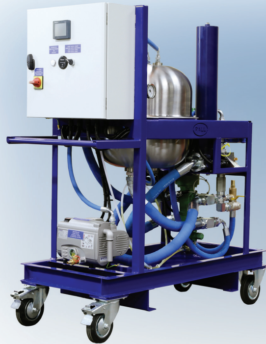
HNP023 Series Oil Purifier

*Water removal rates are affected by the fluid viscosity, temperature, form of water (free or dissolved) and the amount of water present. Pall utilizes a well defined and repeatable test procedure that ensures thorough dispersion of the water in the test fluid initially and throughout the test. The water removal rate shown is for tests with ISO VG 32 mineral based turbine lube oil at 60 °C in the range of 2.6 % to 1.4 % water. The removal rates at higher water concentrations will be significantly higher.